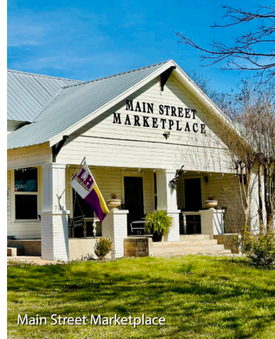
Main Street Marketplace

Seven live bands, eclectic live art demonstrations, wine tastings, artisan vendors, street performers, and a Children's Imagination Garden will allow visitors to interact with artists, while being dazzled with magical opportunities to create, enjoy, and be entertained.